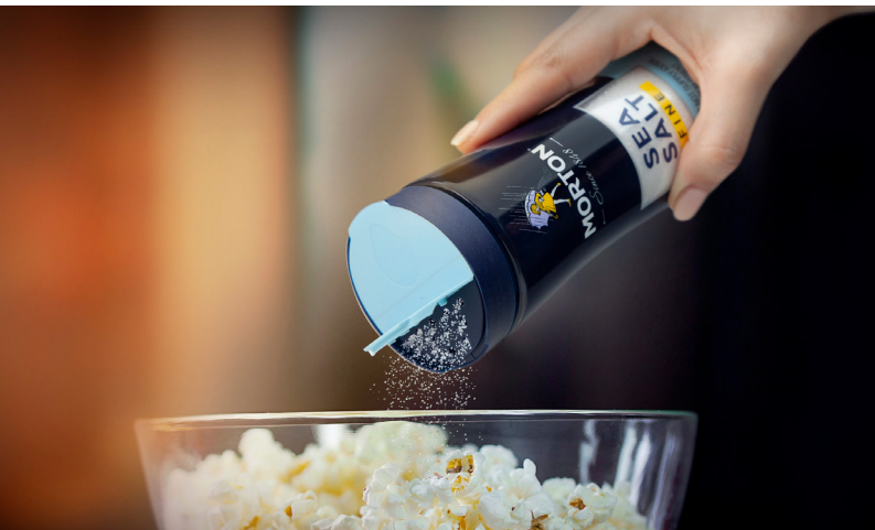
Morton Sea Salt

As the pandemic continues to wane and consumers return to activities away from home, portable packaging will regain popularity. This can include single-use, lighter-weight, and all-in-one convenience.