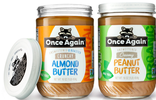
Once Again Nut Butter

According to Elizabeth Avery, president and CEO of SNAC International, “In the next 12 months, expect to see an explosion of all-new snack products made with alternative ingredients, added health benefits, and daring flavors, all to meet the ever-present demands for health, convenience, and fun for the on-the-go consumer.”