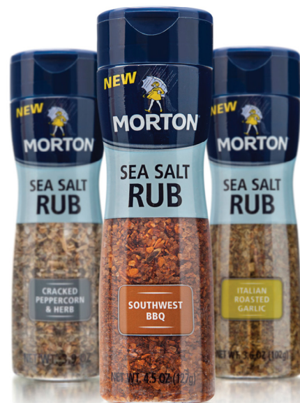
Morton Sea Salt Rubs

In spices and seasonings, it can include ergonomic shapes and closures that allow for one-hand pouring, like Morton's Sea Salt and Sea Salt Rubs, both designed by Studio One Eleven®.