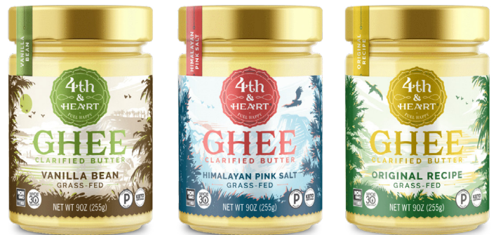
4th & Heart Ghee Oil

People are becoming more curious and adventurous in what they eat and experimenting with unique and unexpected flavors. This includes global ingredients, unusual flavor combinations, and product “mash-ups.” With at-home eating on the rise during the pandemic, consumers are exploring new cooking ideas. Novel food experiences have become a means to bring a sense of excitement to consumers’ lives, contributing to reduced stress and boredom.