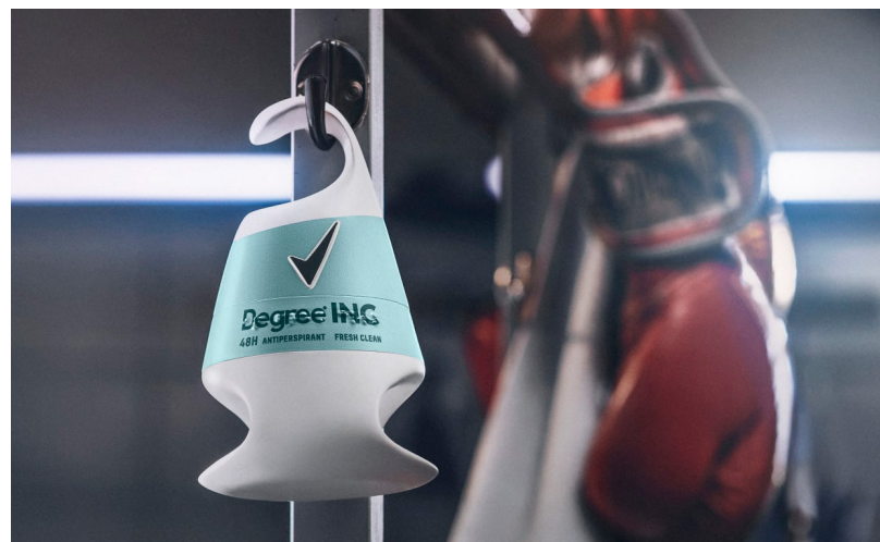
Degree Inclusive for consumers with disabilities

Procter & Gamble has added tactile markings for the visually impaired to some of their Herbal Essences products. Microsoft's new Xbox adaptive controller packaging was re-designed for gamers with limited mobility.